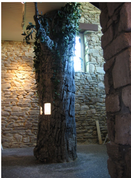
Tree with interactive windows - Museum of the Basilique du Folgoët - La Belle Atelier - Bordeaux